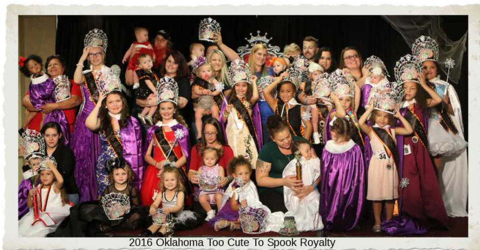
2016 Oklahoma Too Cute To Spook Royalty